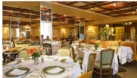
The dining room

The Briguet family describes the restaurant as "classic French with contemporary