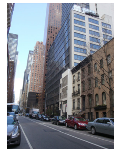
East 48th Street, today

This street would see tenements torn down and replaced by taller apartment buildings and refurbished brownstones. Perhaps more important, it would see residents, old and new, who found their voice and fought hard to protect our ever changing neighborhood and way of life in this "small town" of Turtle Bay.