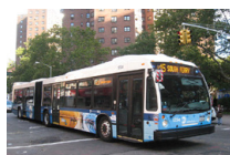
SBS bus before ban on blue lights

It's hard to tell a Select Bus from a local these days, since the MTA turned off the blinking blue lights. State law permits flashing colored lights only on emergency vehicles. The MTA has presented no alternate solution.