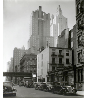
East 48th Street, showing Third Avenue El, 1938

The year is 1939 and you're living on East 48th Street. You may be living in a tenement or one of the brownstones that lined the street at the time, and you could hear the Third Avenue "El" rumbling by, day and night. The El added to the gloom and grime of Third Avenue and the shabby neighborhood.