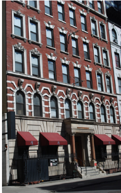
225 East 53rd Street

Samaritan Village will operate a 127-bed shelter at 225 East 53rd Street, for working men who have no homes of their own. The shelter will have round-the-clock security, and 58 cameras will be stationed throughout the facility. The Department of Homeless Services is in the process of completing the paperwork for the shelter, which is expected to open in the next two or three months. Previously, the building served as the location for a medical treatment center also run by Samaritan Village.