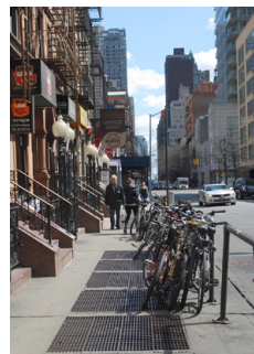
Bicycles and subway grates impede a narrow sidewalk along 53rd Street.