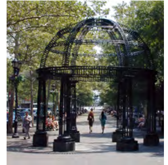
Dag Hammarskjold Plaza today, looking east.

it can look back with pride at some hard-fought struggles to maintain the area’s residential appeal, a major challenge for a neighborhood located between the United Nations’ six-block complex on one side and the office tow-