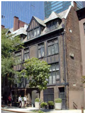
The Efreim Zimbalist House on East 49th Street today houses apartments.