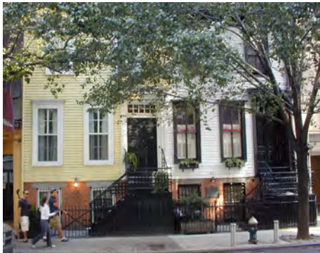
Two clapboard houses at 312-314 East 53rd Street, built in 1866. Both are designated landmarks.

Some 60 years ago this fall, a small group of East 49th Street residents got together at Amster Yard, located between Second and Third avenues, to strategize on how they could scuttle