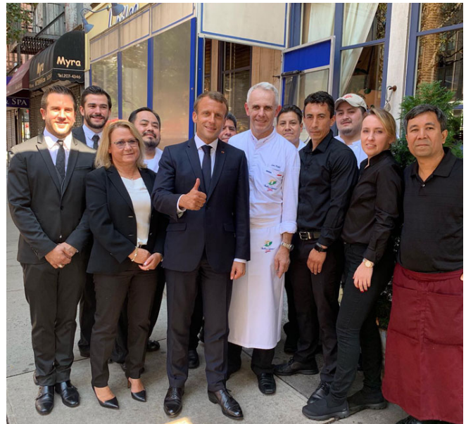
On September 23, 2019, Luc and Ilda were honored to host Emmanuel Macron, French President (thumbs up)

broiled snails cassiolette with garlic and parsley butter - - classic French onion soup with croutons