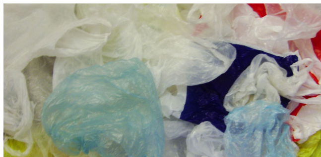
From Wikimedia Commons, the free media repository