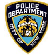
Dermot Shea Police Commissioner