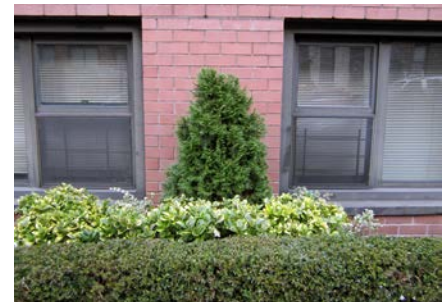
Simple, evergreen garden at 335 E. 51st Street is winter-perfect.