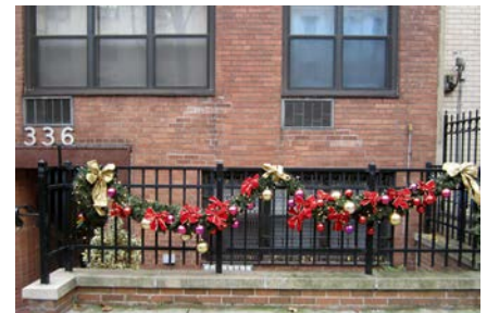
Christmas garland welcomes people to 336 E. 50th Street.