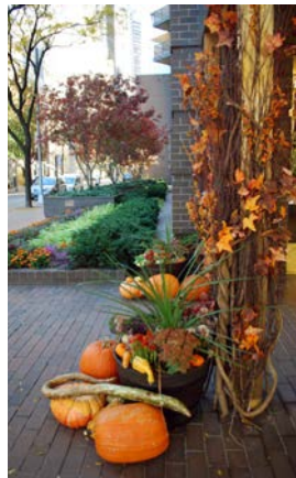
100 UN Plaza reflects Autumn glories.