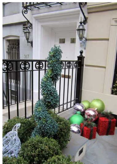
Playful Christmas ornaments brighten 319 E. 51st Street.