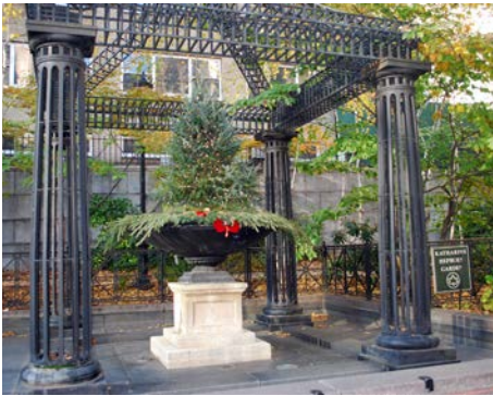
Christmas decorations in Dag Hammarskjold Plaza.