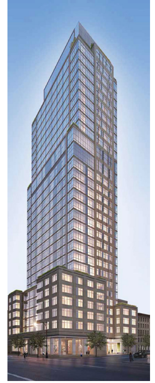
Rendering of Halcyon, 303-305 E. 51st Street at Second.

The radius of East 49th and 50th Streets. from Park to Third Avenues, holds potential for building high and mighty once the East Midtown Rezoning proposal is taken up again. Under the Bloomberg rezon-