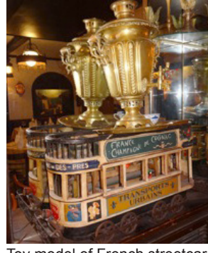
Toy model of French streetcar.

Provençal origins show in its gleaming wine bar, rustic wooden beams, and white stucco walls hung with paintings of the South of France. The entryway features a shelf lined with books by famed authors