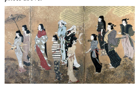
"Cherry Blossom Viewing Picnic" (detail), Japan, Edo period, Kan'ei era, circa 1624-44.

Fri., March 7 through Sun., June 8 Points of Departure: Treasures of Japan from the Brooklyn Museum. More than two thousand years of Japan's art-making history are detailed in more than 70 paintings, prints, sculptures, and decorative objects drawn from the museum's renowned collection of Japanese art. See gallery hours and admission prices above.