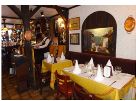
Warm, inviting dining room.

La Mediterrannée has three menus: a three-course prix-fixe; a "classic" French prix-fixe dinner, and an à la carte selection.