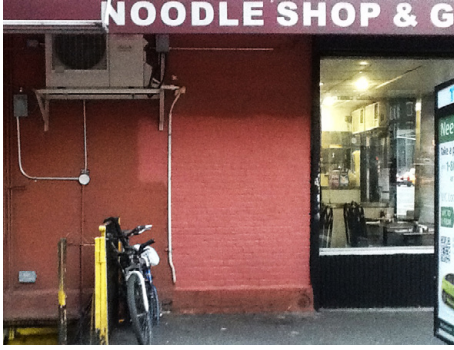
The wall, before and after, above.