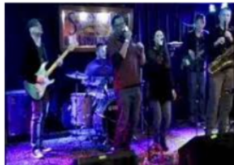
Jazz / Funk / Rock

Carnival Games for Kids • Photo Ops with Police Vehicles Crime Prevention Info • Community Organization Giveaways