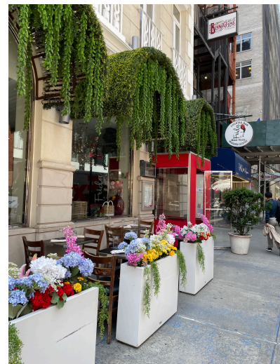
Frida Midtown fridamidtown.com reservations@fridamidtown.com 214 East 52nd Street 212 688 5200