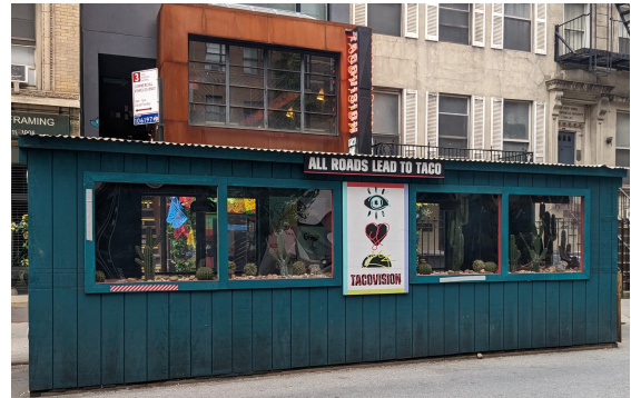
TacoVision tacovisionnyc.com 244 East 54th Street 646 921 1990