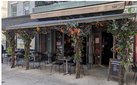
Crave Fish Bar cravefishbar.com 945 Second Avenue 646 895 9585