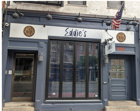
Eddie's eddieson2nd.com eddieson2nd@gmail.com 975 Second Avenue 646 863 2050