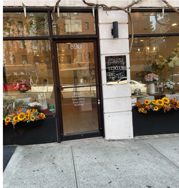
LUXLUF EVENT FLORIST www.luxluf.com 890 First Avenue 212-5405683