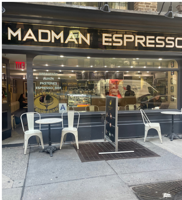
MADMAN ESPRESSO www.madmanespresso.com 141 East 44th Street 646-267-1332