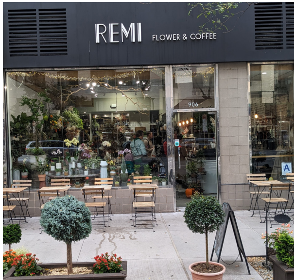
REMI FLOWER & COFFEE www.reminyc.com 906 Second Avenue 646-559-1233