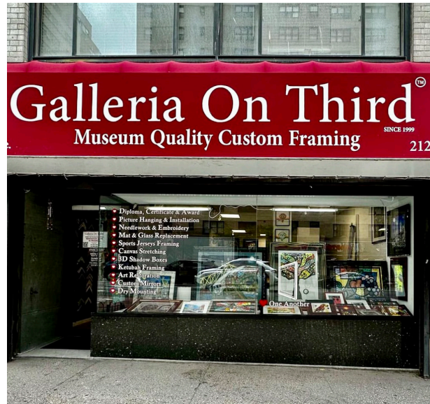
GALLERIA ON THIRD www.galleriaonthird.com 907 Second Avenue 212-683-2886