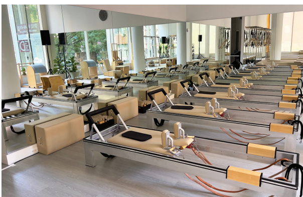
Pilates NYC 919 Second Avenue - 2A 347 541 4401 www.pilatesnyc.com