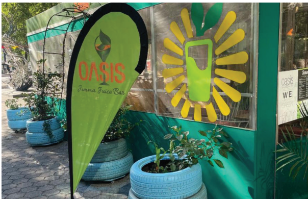
Oasis Jimma Juice Bar 342 East 47th Street 917 379 8330 www.instagram.com/oasisjimmajuice/