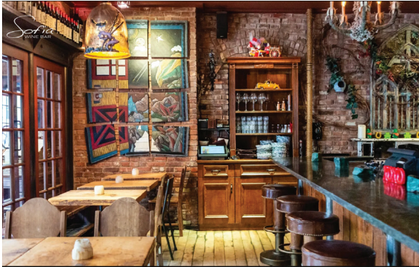
Sofia Wine Bar 242 East 50th Street 212 888 8660 www.sofiawinebar.com